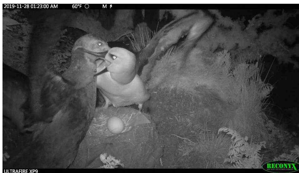
Fig. 2 Male Southern Giant Petrel attacking an incubating Atlantic Yellow-nosed Albatross on Gough Island captured with a motion-sensor triggered camera in November 2019

out of view, so the method used to kill the albatross was not captured on film, but the carcasses were found near the nest.